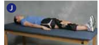
Leg fully extended