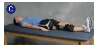
Leg fully extended