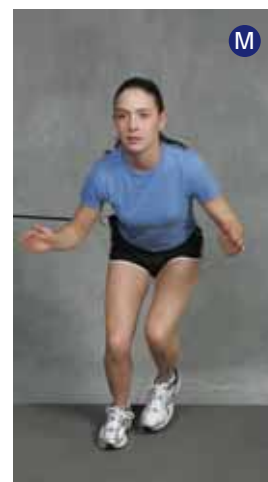
Lateral agility exercise